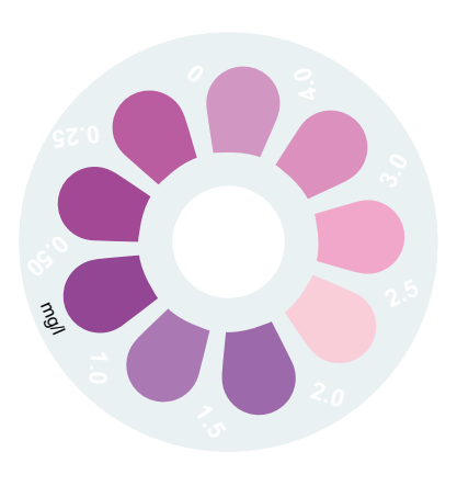
Measure over 50 chemicals

Incubate 20 samples simultaneously. Store and transfer data.