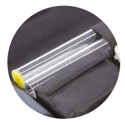
Water Safety Kit (WSK) module

Add additional Colour Discs and reagents for use with the Colour Comparator.