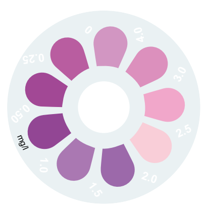
Measure over 50 chemicals

Incubate 20 samples simultaneously. Store and transfer data.