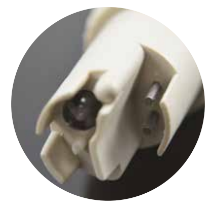
Convenient pocket sensors

Add additional Colour Discs and reagents for use with the Colour Comparator.