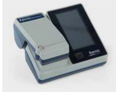
Test Type: Chlorine Chlorine dioxide Chlorite Peracetic Acid (PAA)