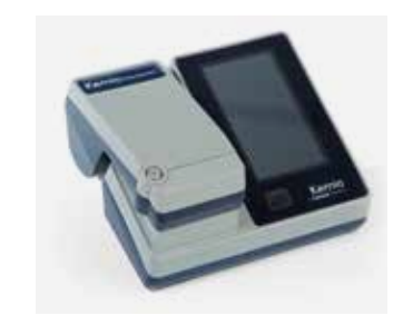
Kemio is the next generation measurement platform.