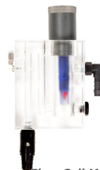
Flow Cell Mounted

An ORP Selection Guide is available on our website, or if you are online, please click here .