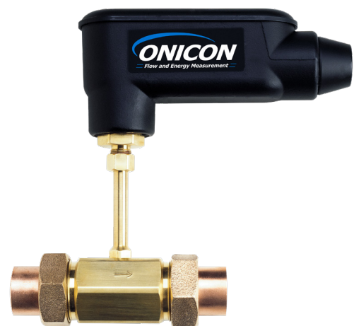
Inline meters are provided with meter couplings. Couplings are available with NPT or copper sweat process connections.