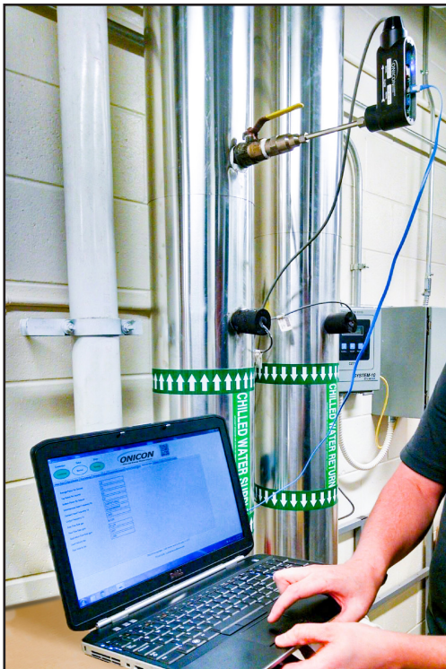
Utility software available allows for programming and field diagnostics.

This version provides a high-resolution frequency output, an isolated analog output for flow rate and a scaled pulse output for totalizing flow. The frequency output allows for connection to ONICON Btu meters or displays. The scaled pulse output may also be configured as an alarm.